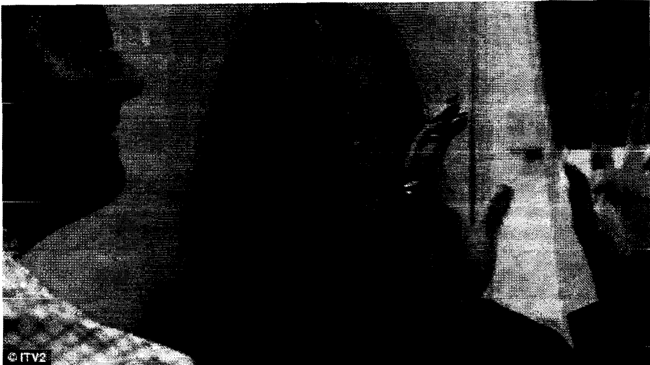
My vision: The 29-year-old said she wanted her rear to 'lift up and come out a little bit'