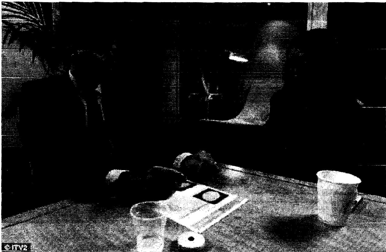
More surgery: The Only Way Is Essex star Chloe Sims visited a surgeon on last night's show to inquire about having buttocks implants

On last night's episode of the ITV2 reality show, the 29-year-old model continued her quest to have the 'perfect' body by attending a doctor's consultation to find out more about the procedure.