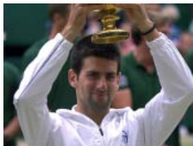
Evidence of Innocence