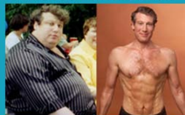
"I was Losing Weight at a Rate of 5-7 Lbs a Week"