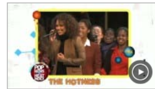
Alicia Keys Surprises Alma Mater