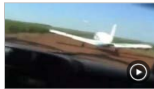
Cops Slam Into Smugglers' Plane