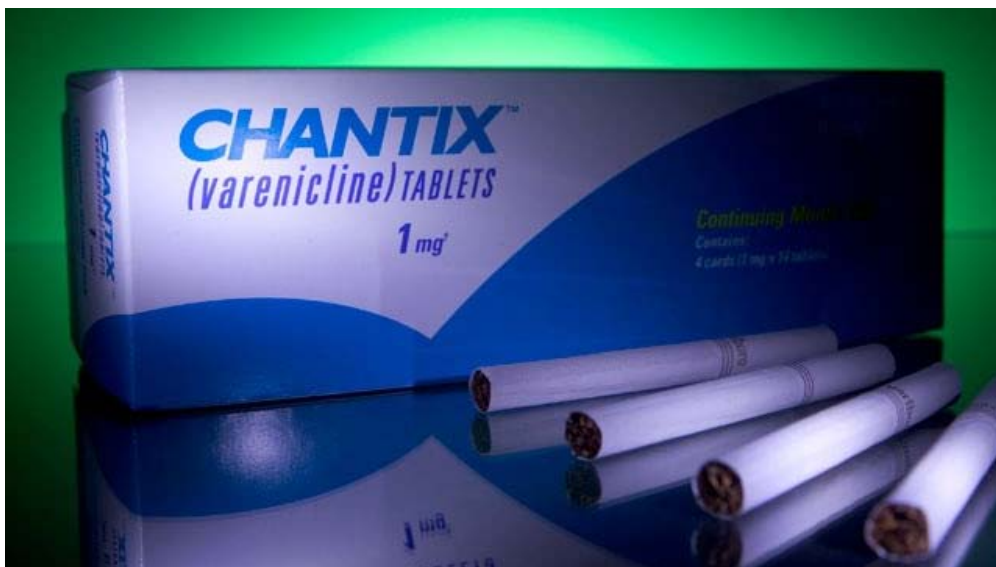
Psychological side effects linked to Chantix make it too dangerous to use as a first-line treatment for smoking, study says.