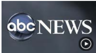
Danger in Stop-Smoking Drug? Watch Video