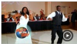
Father, Daughter Dance With Style at Wedding