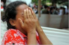
A woman cries. Grief over the death of a loved one can cause a huge spike i...

Email to a friend Share on Facebook Tweet this SHARE